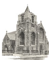
St. Catherine's Church www.meathstreetparish.ie info@meathstreetparish.ie