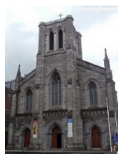
St. James' Church stjamesparish.ie jamestreet@dublindiocese.ie