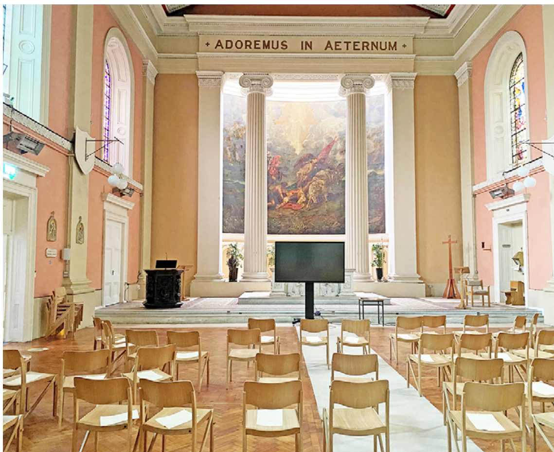
St Paul's Church, Arran Quay, home of the Office of Mission & Ministry; and, below, the 2022 graduates of the Pathways programme, organised by the Office of Mission & Ministry