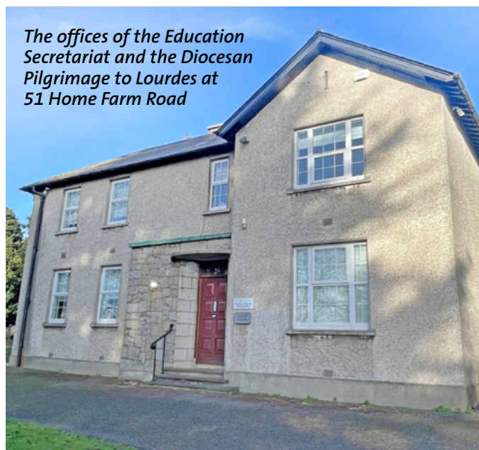
The offices of the Education Secretariat and the Diocesan Pilgrimage to Lourdes at 51 Home Farm Road