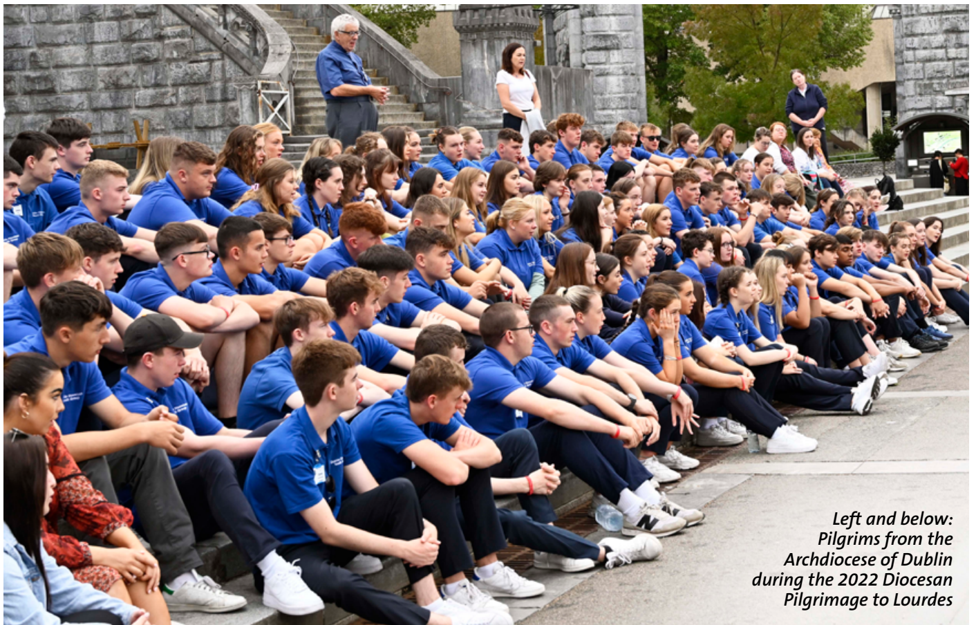
Left and below: Pilgrims from the Archdiocese of Dublin during the 2022 Diocesan Pilgrimage to Lourdes